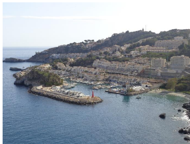
Figure 2. Location map and general view of Marina del Este.

The Marina del Este marina is located in La Herradura, a district of Almuñécar (Granada), bordering the province of Málaga. This locality is situated in a small bay with a beach bottom, flanked by two rocky promontories, Cerro Gordo and Punta de la Mona, to the west and east. Although this structure gives it the character of a natural anchorage, unexpected changes in the direction of the wind drag the boats, which can become stranded on the beach or crash against the rocks. Los Berengueles is the eastern part of Punta de la Mona. This place has appeared on nautical charts since the Modern Age. However, references allude to its use as a place of refuge from westerly winds [47]. The marina was built in the 1980s, incorporating the Peñón de Las Caballas (Figure 2). It currently has 227 berths, with a maximum length of 35 m. It covers an area of about 2 ha, with a maximum draught of 6.5 m and an entrance draught of 3.7 m.