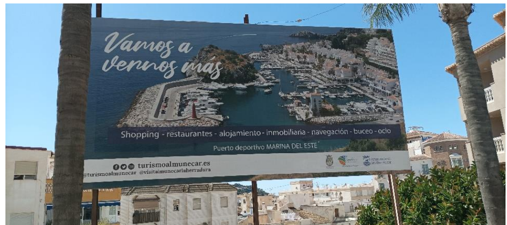
Figure 3. La Herradura tourist promotion advertising poster. Promoted by the Almuñécar Tourist Office, the poster reads “Let’s see more of each other” indicating the activities “shopping-restaurants-accommodation-real estate-sailing-diving-leisure”.

Based on the normalized values after applying the weighting coefficients of the values of use and non-use, it can be seen that the most critical value is the direct use value. It was no surprise, given that it represents the landscape’s most tangible and direct benefit (Figure 4). The physical elements are often the most valued as landscape issues within marinas. However, the importance of highlighting the intangible links with the environment should be pointed out beyond mere physical perception [3].