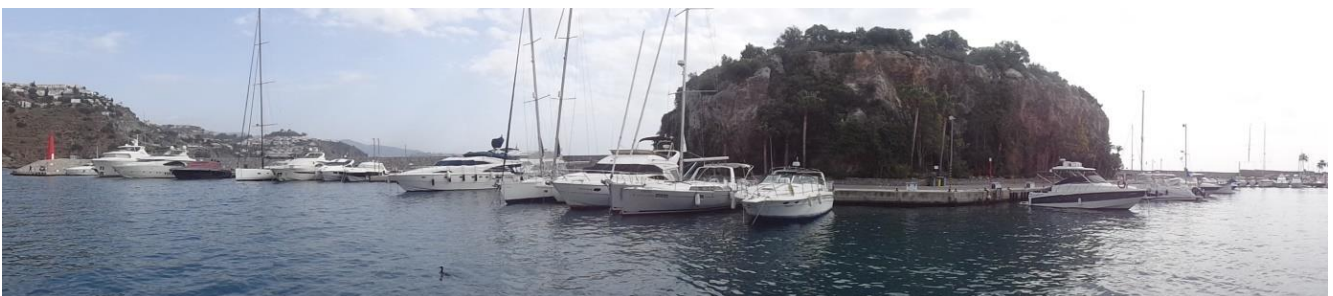
Figure 4. View of the marina basin.

Based on the normalized values after applying the weighting coefficients of the values of use and non-use, it can be seen that the most critical value is the direct use value. It was no surprise, given that it represents the landscape’s most tangible and direct benefit (Figure 4). The physical elements are often the most valued as landscape issues within marinas. However, the importance of highlighting the intangible links with the environment should be pointed out beyond mere physical perception [3].